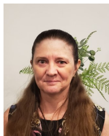
Helen James Committee